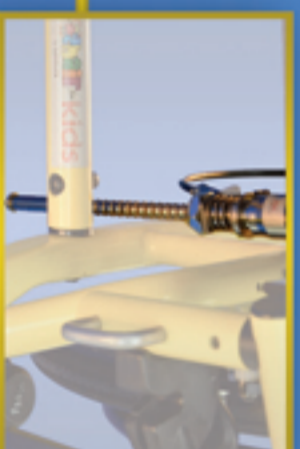
Posi Lock Mechanism locks the wheelchair in tilt position and is controlled by the tilt handle